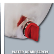
WATER DRAIN SCREW