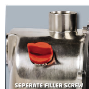
SEPERATE FILLER SCREW